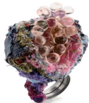
Fig. 2b. It&itself Jewelry. Torino, Canada