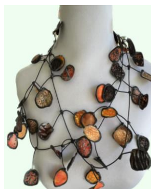
Fig. 4b. Up-Cycled Rubber and Elastic with Batik Fabric