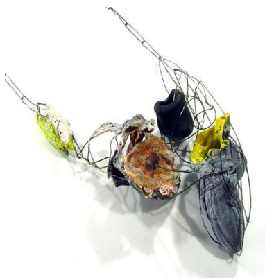
Fig. 1. Akis Goumas and Vivi Touloumidi