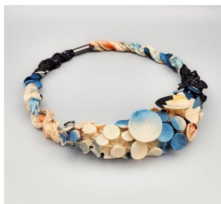
Fig. 2a. Galia Sasson. Necklace, shibori technique