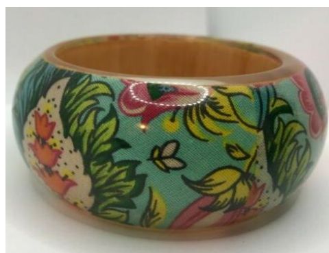
Fig. 4a. Floral fabric bracelet