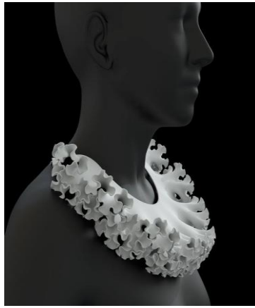
Fig. 5b. Generative design