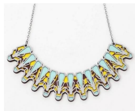
Fig. 4c. Guardian 2 Birch Nicklace-Molly McGrath