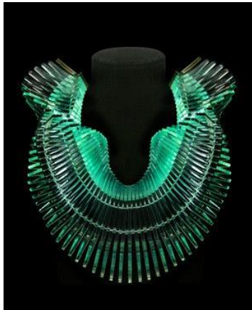
Fig. 5a. Capitra necklace, Sarah Angold