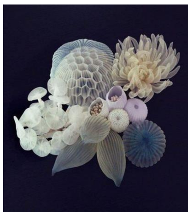
Fig. 3a. Fig.3a Brooches, Mariko Kusumoto