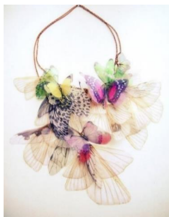
Fig. 3b. Derya Aksoy