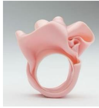
Fig. 5c. 3D creation

the use of nanosensors for resistant adornments, the innovation of the batik dyeing process with the use of nanotechnologies.