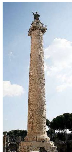
Figure 2. Trajan's Column (113)

From the time of the establishment of Christianity, figures of saints began to be placed on pedestals freed from pagan triumphal images. Thus, on the top of Trajan's Column in Rome (Fig. 2) an image of an eagle was first placed, later a statue of Trajan, and in 1588 a sculpture of the Apostle Peter. The Marian Column in Munich (1638) is crowned by a figure of the Virgin Mary. The imperial style of Ancient Rome found an echo in the Empire stylistics of the nineteenth century, an example of which is the Colonne Vendôme (1810) in Paris.