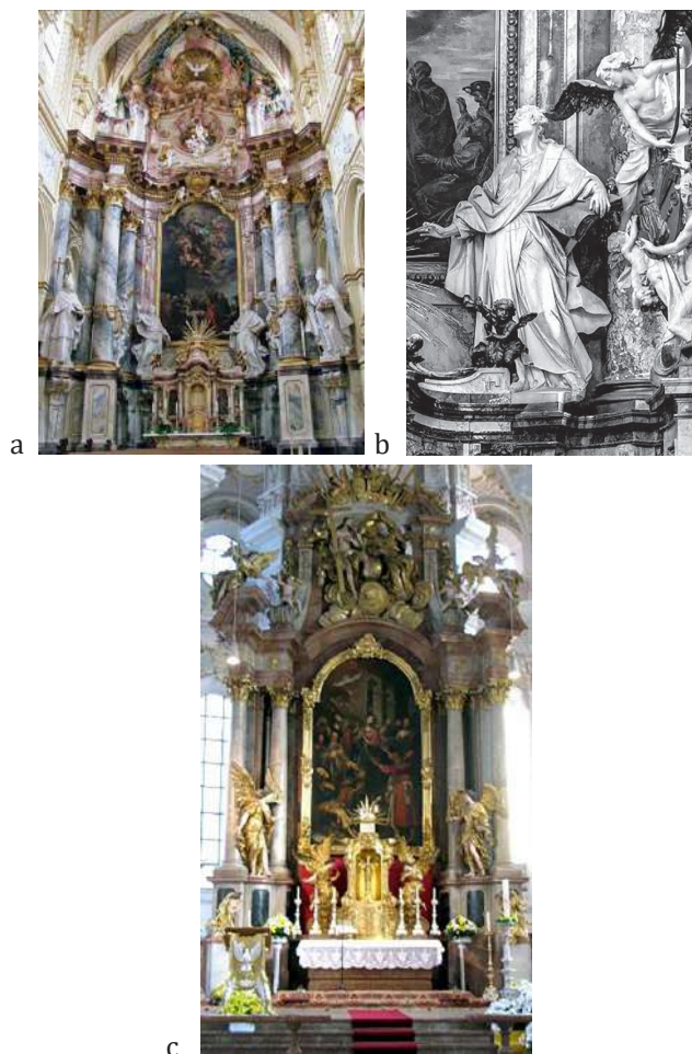
Figure 5. Architectural and sculptural elements of Baroque churches of the eighteenth century

Note: a, b – J. Wagner, High altar and fragment – statue of John the Evangelist, Kloster Eberbach, Ebrach (1778/80); c – Heilig-Geist-Kirche, Munich (1730)