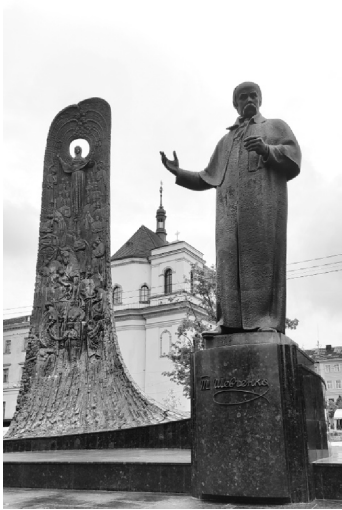
Figure 8. Statue of Taras Shevchenko in Lviv

the Ukrainian poet T. Shevchenko (Fig. 8). O. Yakymova (2023) noted that the formation of historical-national (symbolic) images in monumental art of Eastern Galicia at the beginning of the twentieth century, in particular images of heroic figures, became an expression of national revival and often synthesised the secular and the sacred, as in the monument to Taras Shevchenko in Lviv, where the poet acquires features of a sacred composition. This confirms the universality and vitality of the artistic mechanism of synthesis of the arts and symbolic iconographic borrowings for creating the image of the spiritual leader of the nation, which the researcher identified in the art of the first third of the twentieth century.