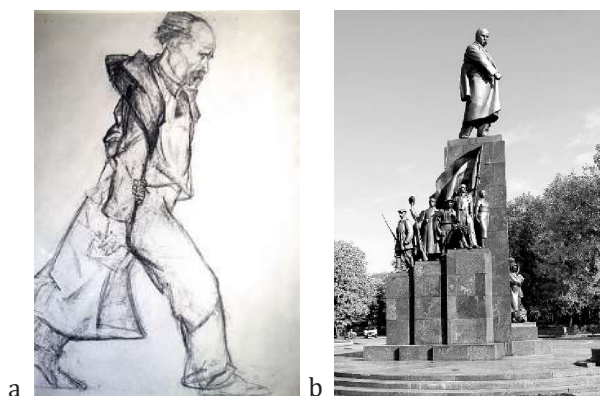
Figure 10. Sketch and pedestal for T. Shevchenko, related to the figure of A. Mickiewicz

The expression of the figure depicted in a wide stride is characteristic of the theme of the path, widespread in various forms of the plastic arts, literature, and music of the modern period. Such a motif of movement embodies not only physical displacement but also the symbolic dimension of spiritual and national progress. In sketches for the monument to Shevchenko, F. Krychevsky depicted the figure in turbulent motion (Fig. 10a), which is related to the monument to A. Mickiewicz in Paris, where the dynamics emphasise the poet's prophetic mission. In the 1935 monument (Fig. 10b) T. Shevchenko, placed on the top of a stepped pedestal, points the way to the freedom of the people, personified by the heroes of the author's works, thus forming a unity between the artistic image and the national idea. This comparison made it possible to see the commonality of ideas and artistic language in the embodiment of the figures of national geniuses in different cultural traditions.