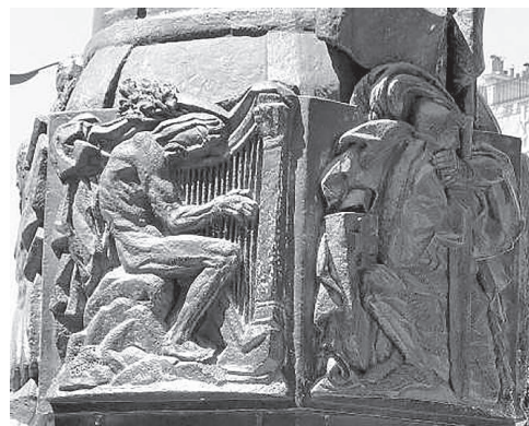
Figure 11. Relief of the monument to A. Mickiewicz in Paris, lower part

The harp, like the lyre, belongs to the emblematic attributes of heroes of classical art.