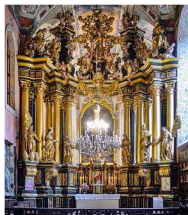
Figure 6. Church of Saint Andrew, Lviv

The pose, gesture and placement of the statue of the poet by the column correlate with depictions of apostles and other saints portrayed at the moment of divine revelation (Fig. 6). In particular, the vertical orientation of the figure, the slight raising of the hands and the gaze directed upwards create a sense of spiritual elevation and connection with the transcendent. The columnar composition emphasises the central axis of the hierarchy of the figure, recalling the architectural and sculptural devices of sacred ensembles in which saints are depicted in the act of receiving divine revelation. The gesture of the poet can be interpreted as a symbolic message to the viewer, which unites the spiritual, moral and cultural functions of the monument, while the mutual placement of the statue and the architectural column creates the effect of a dialogue between the human being and the sacred space, analogous to the traditions of Renaissance and Baroque iconography.