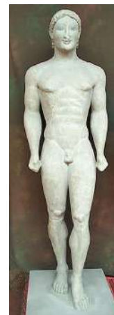
Figure 14. Munich kouros, 540-530 BC

To express the state of inner creative impulse, O. Kniazyk depicted the poet striding swiftly in inspiration. It was necessary to find the degree of conventionality in conveying movement. The internal structure, proportionality of forms and conciseness correspond to the creation of the expressiveness of the image. In the search for a solution to a complex plastic problem, the sculptor turned to the principles of the architectonics of Greek archaic art. Ancient sculptors did not depict the real rhythm of the opposite movement of arms and legs, therefore the basis was the formula of restrained dynamics of Greek kouroi, where, with the conventional depiction of the legs in stride, the calm of the torso is preserved (Fig. 14).