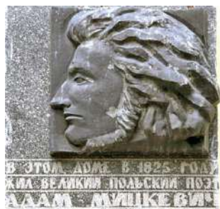
Figure 16. S. Holovanov, Memorial plaque to A. Mickiewicz

In creating the image of A. Mickiewicz, artists expressed their own perception of the genius personality. On the building of the Richelieu Lyceum in Odesa, where A. Mickiewicz worked, a memorial plaque has been installed (Fig. 16). The profile image makes it possible concisely to convey the characteristic features of the hero's face. It is no coincidence that such a viewpoint was used in coats of arms, coins, and medals. The expressive silhouette of the poet's face is inscribed in the stable form of a square. Kniazyk's "round" sculpture makes it possible to perceive it over time from different viewpoints.