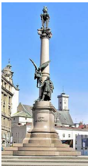
Figure 1. Monument to Adam Mickiewicz (1904)

artistic language to embody the image of the Polish national poet-prophet. The symbolism of the monument to A. Mickiewicz in Lviv reflects local traditions. During its construction (Fig. 1) the concept of A. Krekhovetskyi was adopted, which consisted in the column being the basis of the monument. The idea of the column was linked to an orientation towards the monument to King Sigismund III Vasa in Warsaw (1643). Considering the symbolism of the column in the culture of different times and peoples, J. Tresidder (1997) defined it as an emblem of divine power and pointed to an obvious parallel with the Axis of the World. As an archetype of the European monument, the column is historically associated with the imperial heritage of the culture of Ancient Rome, where statues of gods and emperors close to the gods were placed on the tops of columns. The statue of A. Mickiewicz was installed on the site where, until 1904, there had been a fountain with a statue of the Virgin Mary. The renaming of Mariacka Square in honour of the poet testifies to the assertion of the secular principle over the religious worldview.