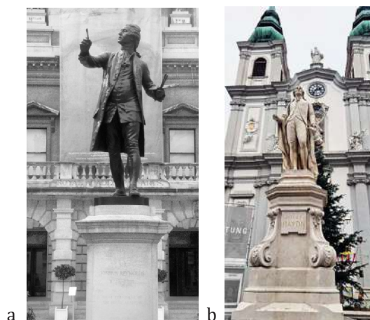
Figure 7. Use of the heritage of sacred art in monuments to poets and artists

An example of the use of the heritage of sacred art in secular monuments of Europe can be seen in the roughly contemporary monuments to the English artist J. Reynolds and the composer of Viennese Classical music J. Haydn (Fig. 7). Common to both monuments is the state of inspiration, expressed in poses, gestures and faces turned towards the sky. Architecture decorated with columns of the classical order serves as a background for the figure of the composer. The placement of the statue of J. Haydn in the open space of a city square is virtually related to the central image in the altar composition of a church interior.