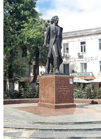
Figure 13. "Monument to A. Mickiewicz" Note: Odesa (2004)

The monument to A. Mickiewicz in Odesa (2004): The significance of the monument in the harmonisation of the urban environment. In 2004, on the central avenue of the port city of Odesa, the monument to A. Mickiewicz was unveiled (Fig. 13). Unlike the grandiose architectural monuments of Lviv and Paris, the monument in Odesa has a chamber character. It belongs to park sculpture and is successfully integrated into the green environment of the city's central avenue. The architect limited the place of its placement by shifting it into an autonomous zone and including it in the form of a circle enclosed by a low kerb. The monument is of small size: the three-metre bronze statue is set on a pedestal 1.5 m high, close to the stable form of a cube. Grey and polished pink granite, alternating rhythmically in colour, frame the figure of the poet, located on the central axis of the circular platform. In the peculiar geometric architectural "frame" of the sculptural image, the geometric forms of the cube (a symbol of the earth) and the enclosing circle, which symbolises the infinity of the sky, alternate.