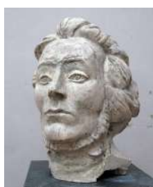
Figure 15. Fragment of the plaster model of the monument (2004)

to the face raised to the sky and the open shoulders; in profile there is an added restrained aspiration forwards, emphasised by the expressive rhythms of the graphic lines of the hair and the folds of the cloak-mantle, which billows in the gusts of wind. The clothing of the figure also carries symbolic meaning: the hood is associated with wings, and the frock coat and cloak reproduce the features of the historical period. The concise solution of the pedestal and the sculpture directs the viewer's attention to the expressive face of the poet, raised to the sky (Fig. 15). O. Kniazyk carefully studied documentary lifetime images of Mickiewicz, as well as the image created by A. Bourdelle in sculpture. The face of A. Mickiewicz changed, but the characteristic feature remained the pose of self-absorption.