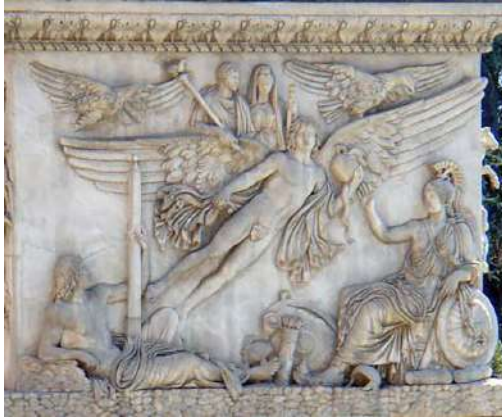
Figure 12. Pedestal of the Column of Antoninus Pius

The embodiment of the idea of Poland's freedom in the monument to A. Mickiewicz in Paris proved to be more significant than the classical allegory of poetic inspiration presented in the form of a winged Pegasus in the 1909 design for the monument. In the image of A. Mickiewicz there is a synthesis of literary, musical and philosophical ideas, which makes a poet a universal symbol of freedom. In the sculpture of A. Bourdelle, as one of the leaders of sculpture of the late nineteenth and early twentieth centuries, the legacy of ancient art is combined with innovation, expressed in the ideological content of a complexly constructed composition. The expressiveness of A. Bourdelle's artistic language influenced the renewal of the form of sculpture in the twentieth and early twenty-first centuries. Its echoes can be traced not only in French but also in Eastern European sculpture. In particular, the plastic language of A. Bourdelle had a mediated influence on the style of the Ukrainian sculptor O. Kniazyk.