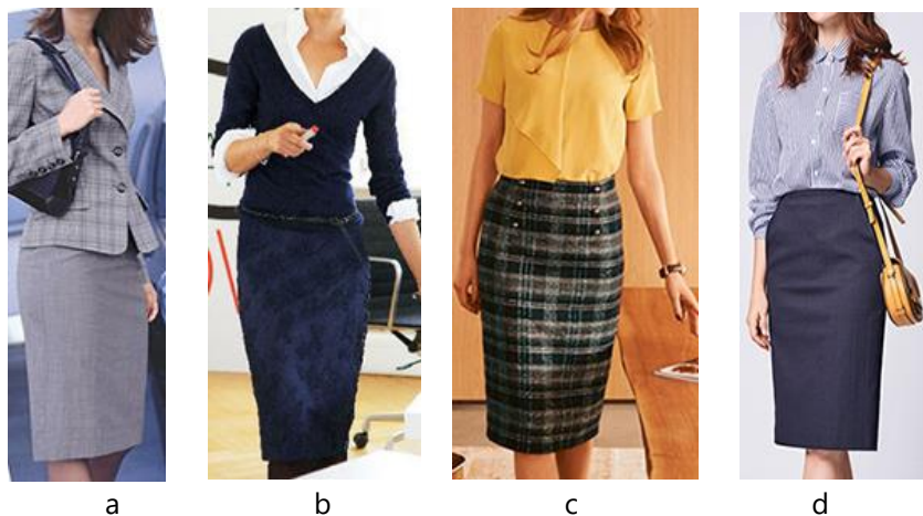
Figure 3. The designs of tube skirts, presented in Burda Moden Magazine in different years: a – 2006; b – 2011; c – 2015; d – 2019 [3]