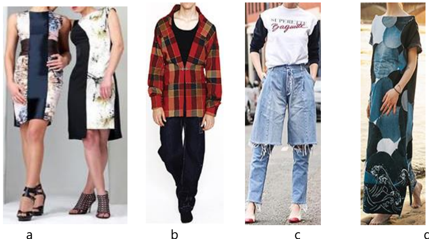
Figure 1. The designs of clothes, made in different directions of eco-design: a – models of women's dresses, made from Qmilk fabric [13]; b – model of men's jacket, designed by Timo Rissanen in accordance with "zero waste" principle [1]; c – model of women's jeans, designed by Ksenia Schnaider, upcycling [16]; d – model of women's dress, KLAPTYK-fashion brand, technique "patchwork" [15]