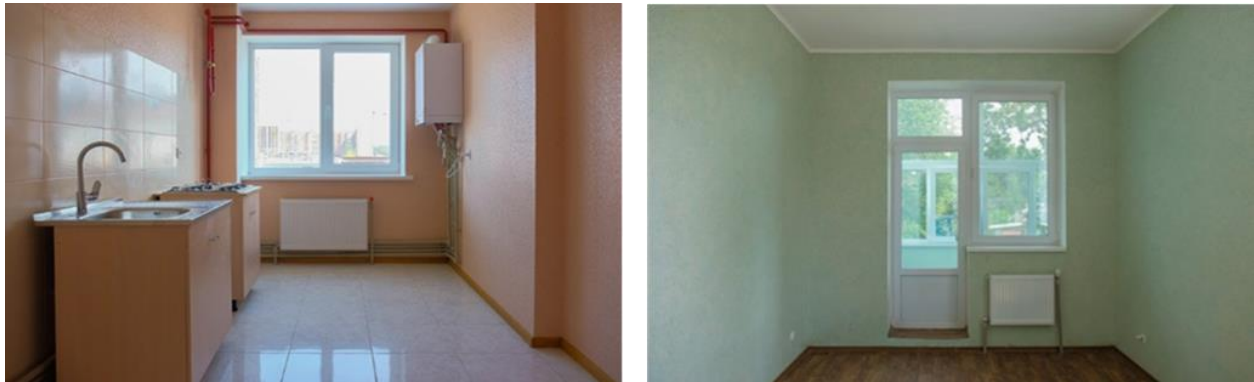
Fig. 1. Interior of social housing in the center of Slobozhanska united community, 2020 and housing in the village. Tsarychanka, Dnipropetrovsk region 2018 [14]