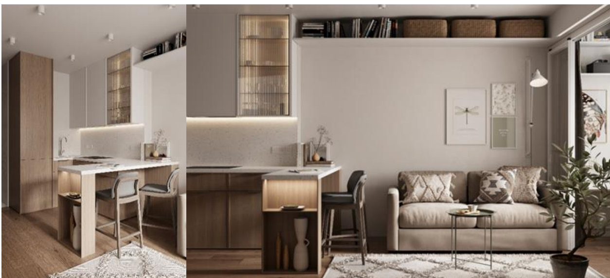
Fig. 3. Perspective image of a smart apartment in the Smart Oseli residential complex, Kyiv. Kitchen, recreation area and office (author's project)